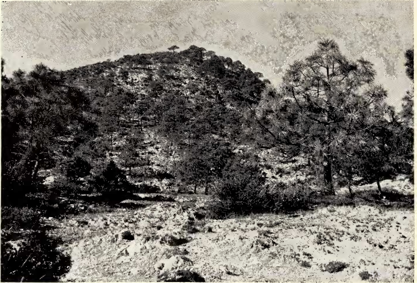
FIG. 3. Pinus arizonica var. stormiae on nearly solid rock in a very dry area near Ascensión.

most, however, being made up the mountain from Zaragoza and around La Encantada.